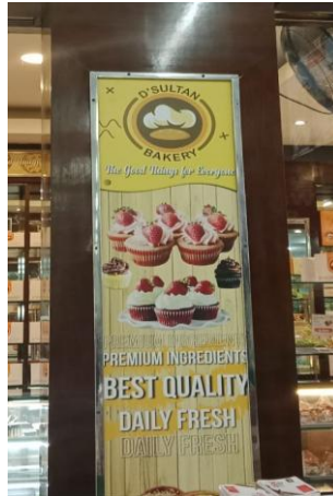
D'Sultan Bakery, Sawahan, Padang

In the linguistic landscape of bakery shop signage, language functions as one of several modes through which meaning is communicated. For example, textual elements such as product names, descriptions, slogans, or humorous wordplay can attract attention and create a certain tone or atmosphere, while visual elements may evoke emotions or appeal to the senses (e.g., images of freshly baked bread). By exploring how these different semiotic resources interact, a multimodal analysis allows for a comprehensive understanding of how bakery shops use signage to construct messages that extend beyond mere words.